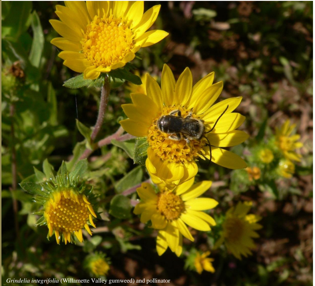
Grindelia integrifolia (Willamette Valley gumweed) and pollinator