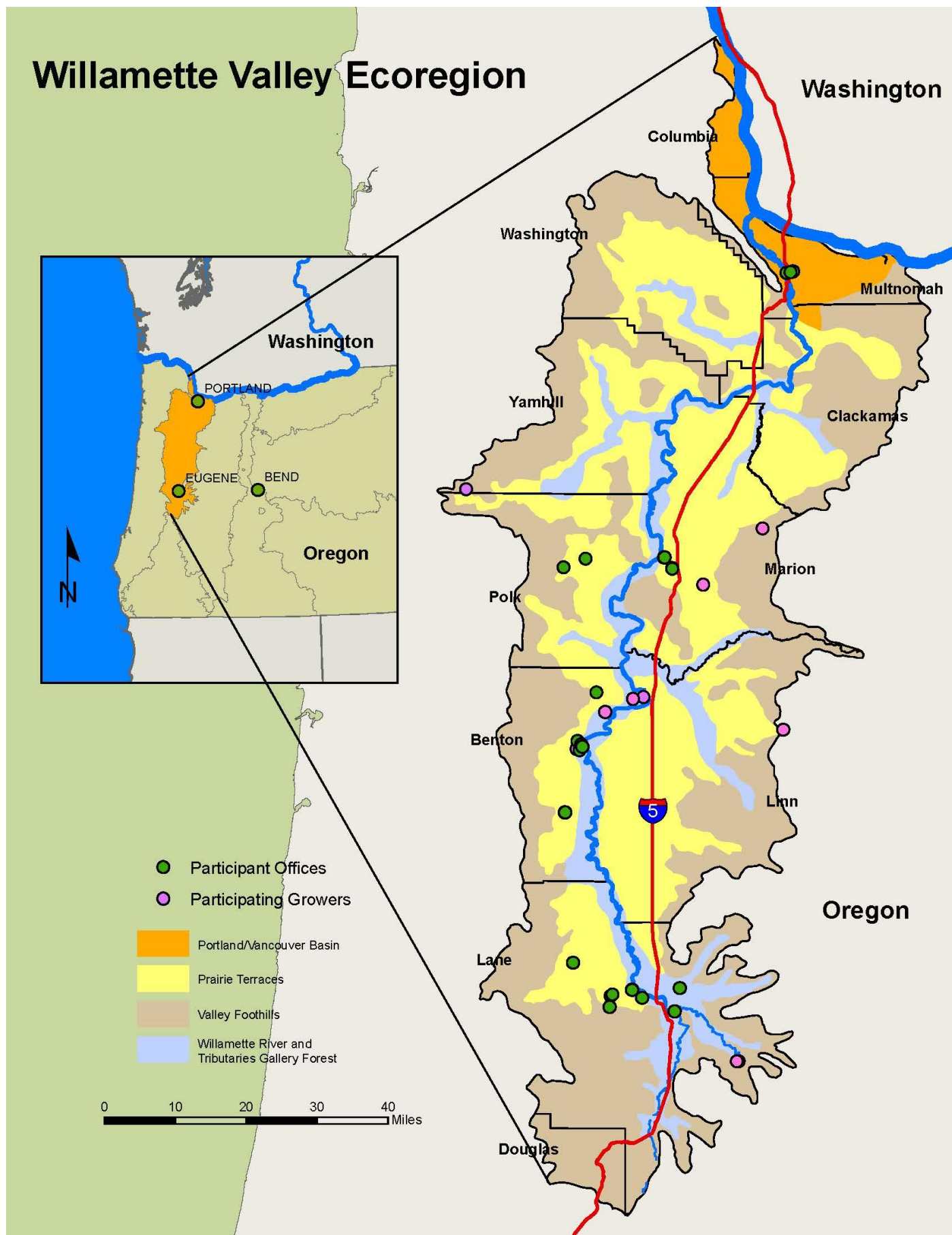
Figure 1. Locations of WVNPM members in the Willamette Valley.