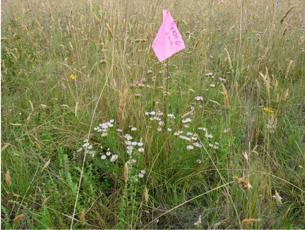
Figure 1. A flagged Willamette daisy at the Sublimity site in 2005.

We returned to each population at least once (often several times) in order to collect flower heads with mature seeds. We relocated flagged plants, and then collected 1 or 2 flower heads that had finished flowering and had mature seeds still attached from each plant. We placed each individual flower head in a separately labeled coin envelope. Because seeds of this species remain on the head for only a short time after they reach maturity, collecting seeds required getting to each site shortly after most flowers had withered and seeds had matured, but before seeds fell or were blown off the flower heads. Seed collection was conducted throughout July of 2005 and 2006.