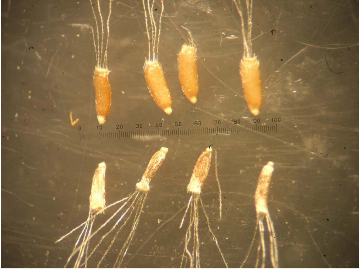
Figure 3. Filled and empty ovules of Willamette daisy from Sublimity grassland (2005).