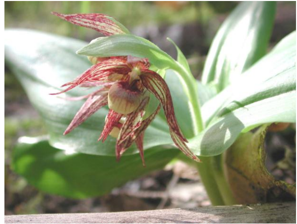
Figure 1. Cypripedium fasciculatum .

Clustered lady's slipper ( Cypripedium fasciculatum Kellogg ex S. Watson; synonym includes Cypripedium knightiae A. Nelson) is listed as a candidate for listing by the Oregon Department of Agriculture, a Federal Species of Concern, and a Heritage Rank S3 species (rare, threatened, or uncommon in OR; ORBIC 2010). The orchid is rare throughout its range in the western United States. More than 800 locations for clustered lady's slipper have been identified in the Medford District BLM. Many of these populations had ten or fewer individuals at their last survey date; the current status of most of these populations is unknown. It is difficult to determine if small population sizes are normal and healthy or if they are at an elevated risk of extirpation. In an analysis of clustered lady's slipper and mountain lady's slipper ( Cypripedium montanum ) populations in California, we found that over the period of time follow-up observations were made (1 to 23 years), approximately 66% of populations declined in size and 30% - 45% fell to zero (Kaye and Cramer 2005). Both population size and time since previous observation were significantly correlated with extinction events. The purpose of this project was to survey populations of clustered lady's slipper in the Medford District BLM in order to better model the probability of extinction [Population Viability Analysis (PVA)] for this species.